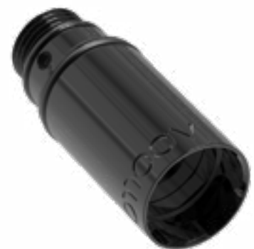
Body posterior view