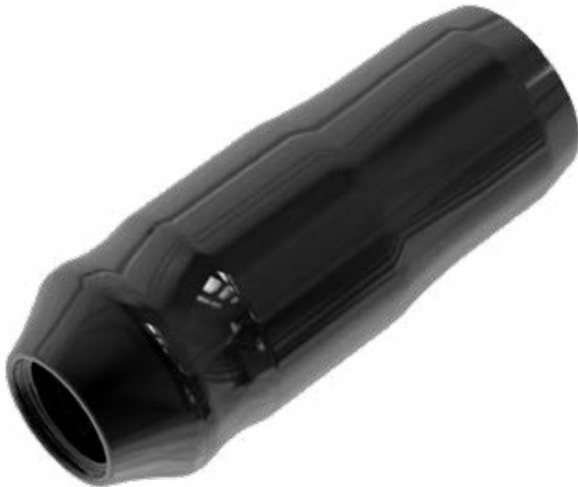
Autoclavable Ergonomic Grip design