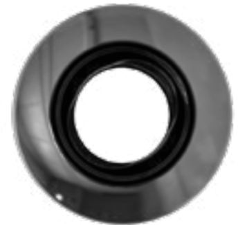
Compatible with most membrane needle cartridges on the market