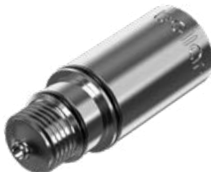
Body isometric view

The Body is the core of the machine that houses all the machine components. Constructed from a solid rod of 6061 T6 aircraft- grade aluminum, this module should be sanitized by wiping it with cold sterilization solutions only. Caution: Do not introduce any types of liquid inside the system.